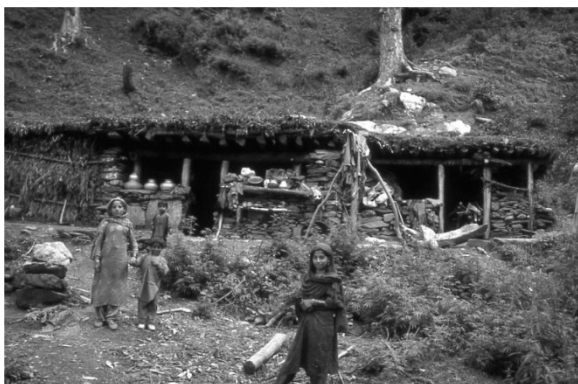
Figure 1. Permanent transhumant house in Upper Swat

Table 2 shows the plant and animal taxon recovered and identified from each site, and the following is a brief summary of some of the main points apparent in this material. From the Swat sites there is evidence for the use of both wild and domesticated plant foods during the same periods, and there are also a wide range of cereals, including wheat, barley and rice, which indicates that both summer and winter crops were being grown (Costantini 1979; 1987). The presence of barley alongside wheat could be interpreted as production of the former for animals, with wheat more suited to human consumption. The animal assemblage is dominated by sheep/goat and cattle (Compagnoni 1979; 1987; Jawad 1998). Overall, the differences between the environmental material from each of the sites reviewed is as great as between these sites and the Bala Hisar of Charsadda.