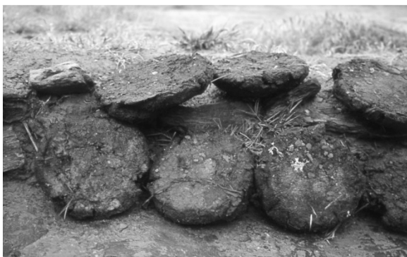
Figure 3. Dung cakes prepared for exchange with settled agriculturists