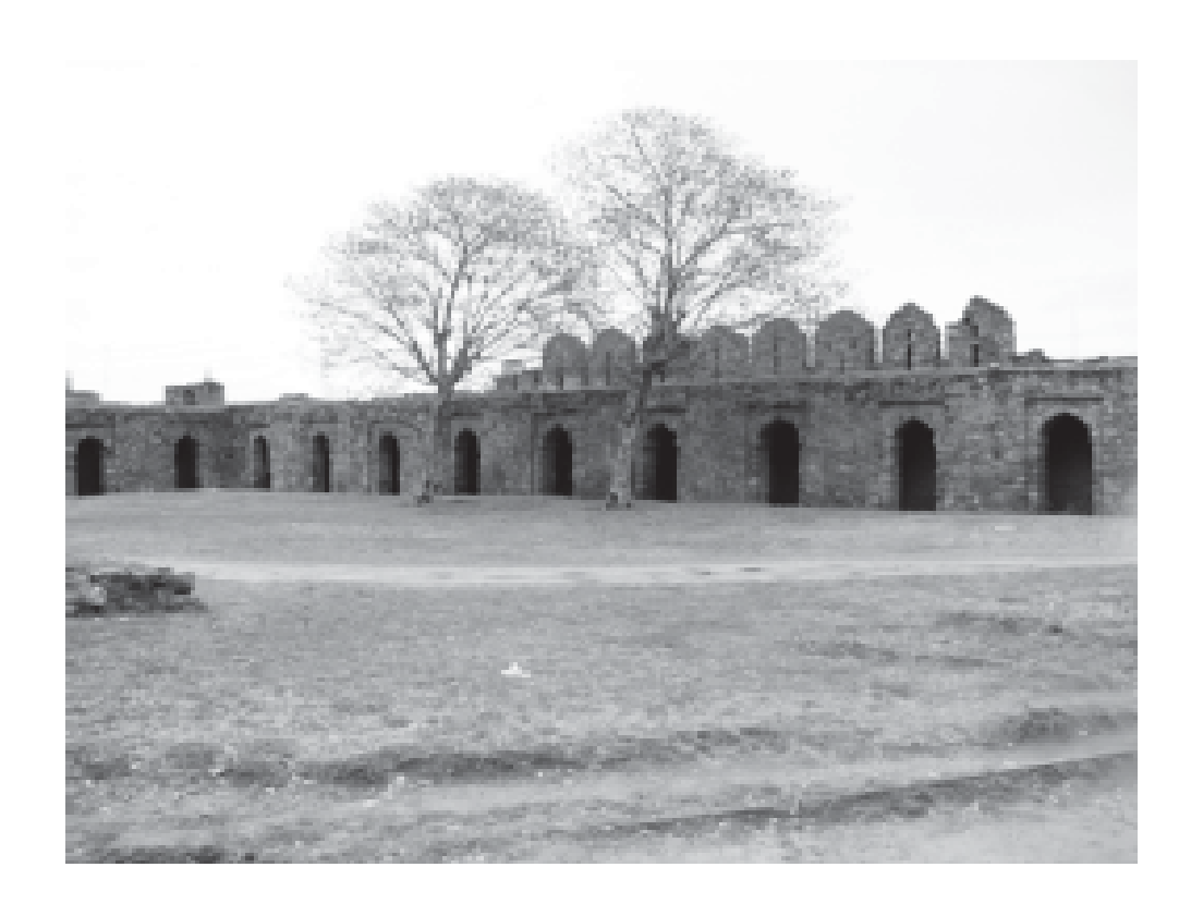
Pl.III. Rawat: A View of the Rooms from the courtyard