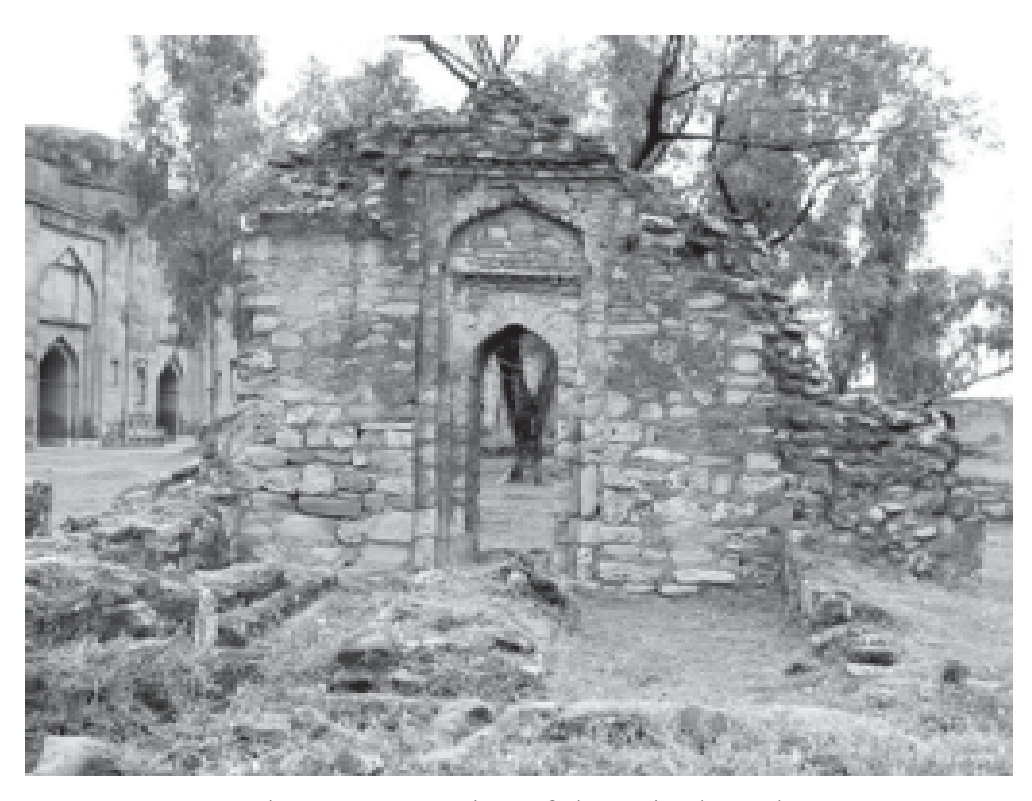
Pl. V. Rawat: View of the Ruined Tomb