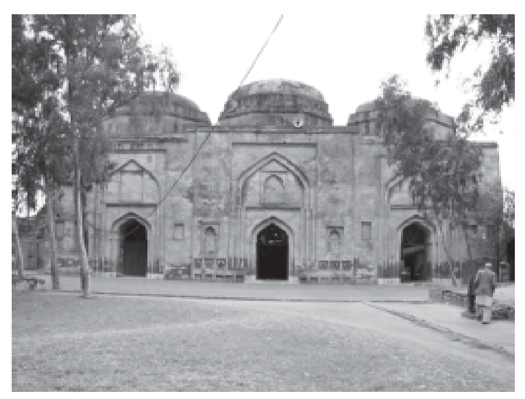
Pl.VI. Rawat: General View of the Mosque