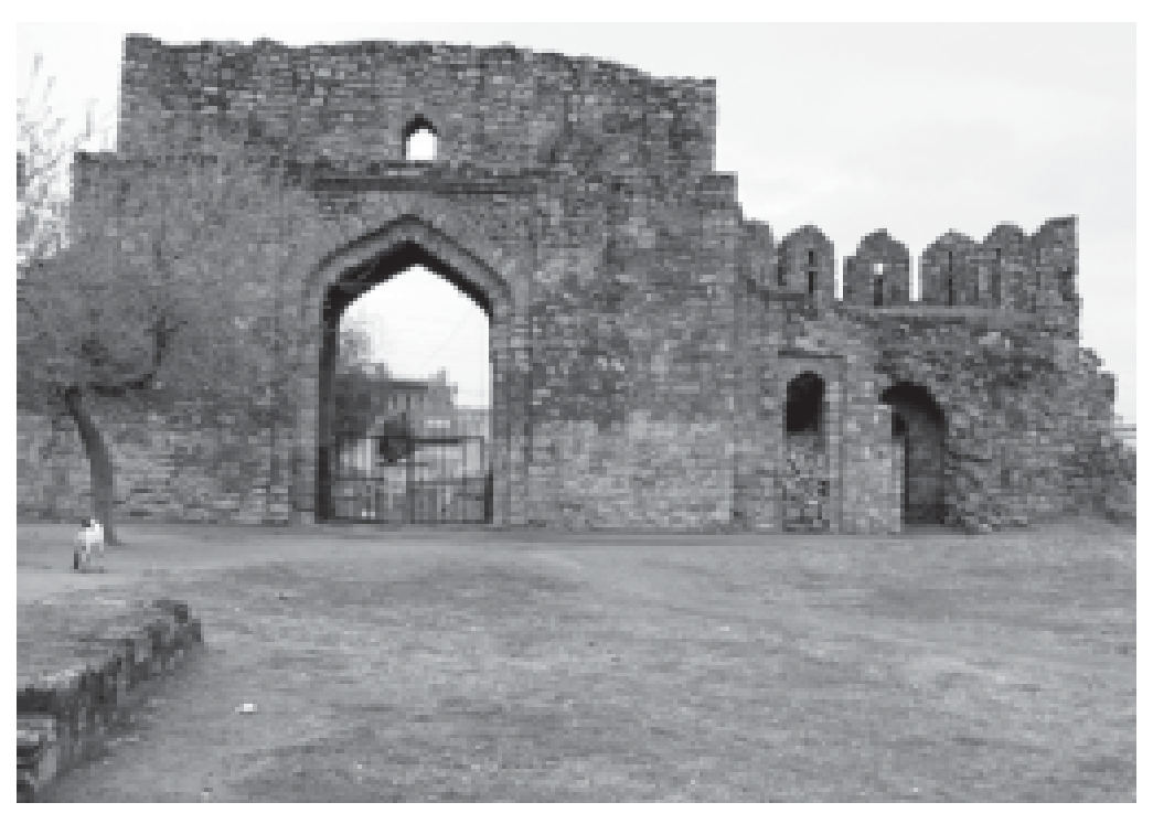
Pl.II Rawat : A View of the Eastern Gateway from the inner courtyard