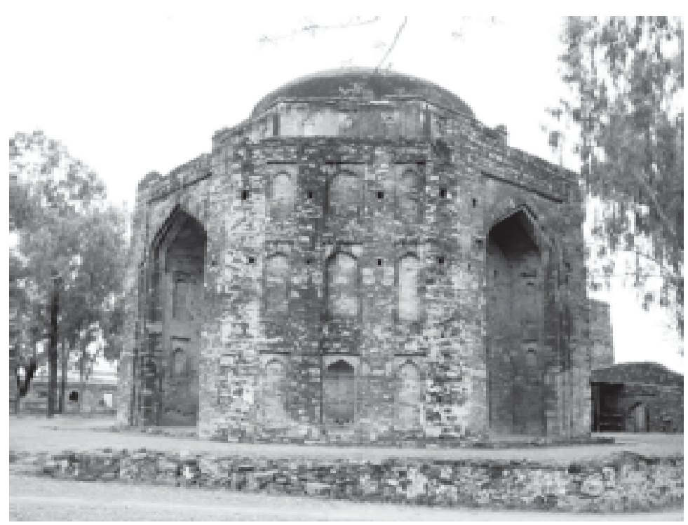
Pl IV. Rawat : General View: Tomb of Sardar Sarang Khan