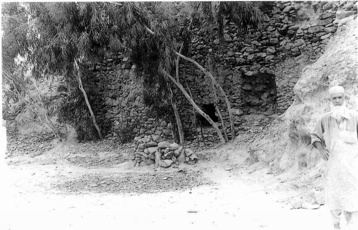
Pl. 3: Adinkhel: Structural remains.