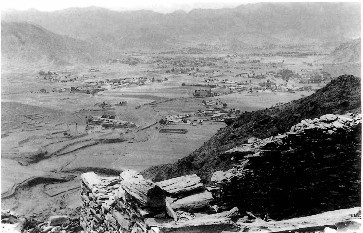
Pl. 6: The valley below, as seen from the settlement.