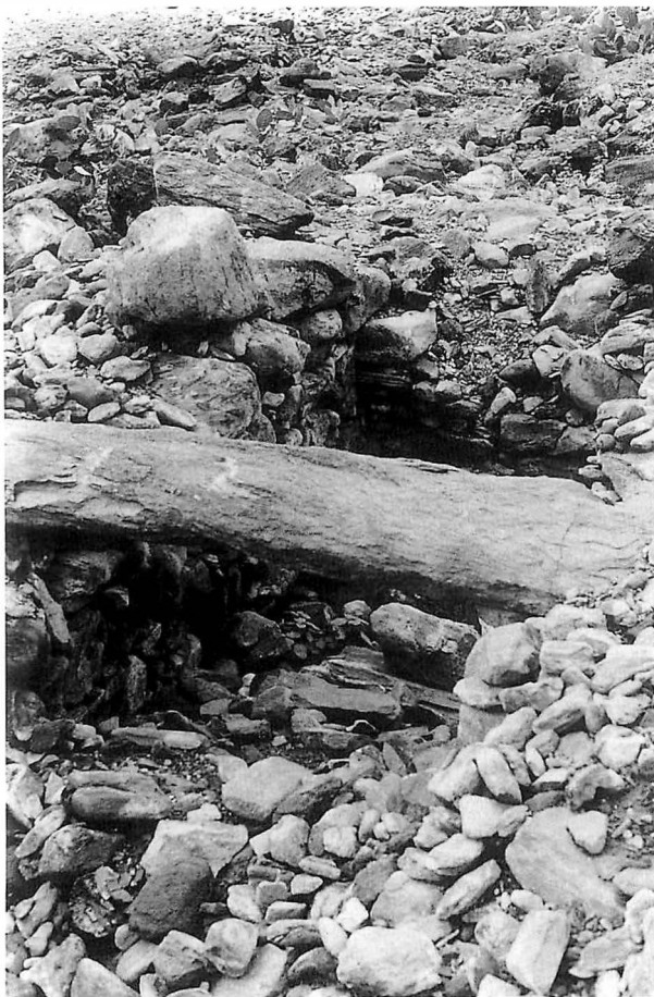
Pl. 9: Pandyalai: Grave with one of the capstone.