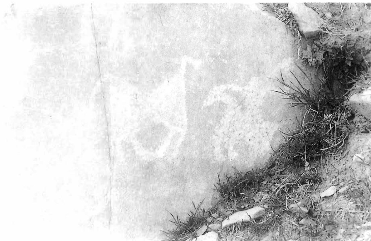
Pl. 2: Alingar: Hunting scene on the rock.