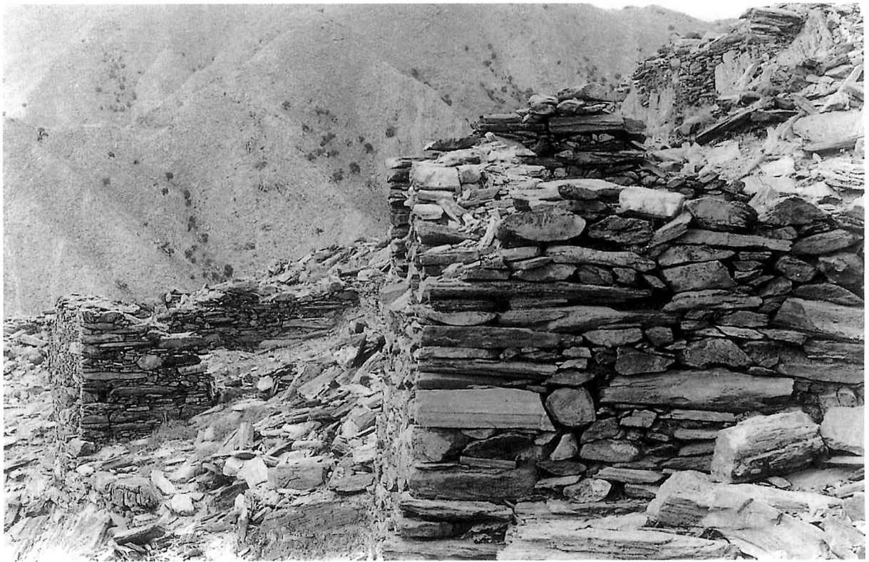
Pl. 5: Khazano Sar: Structural remains of a house.