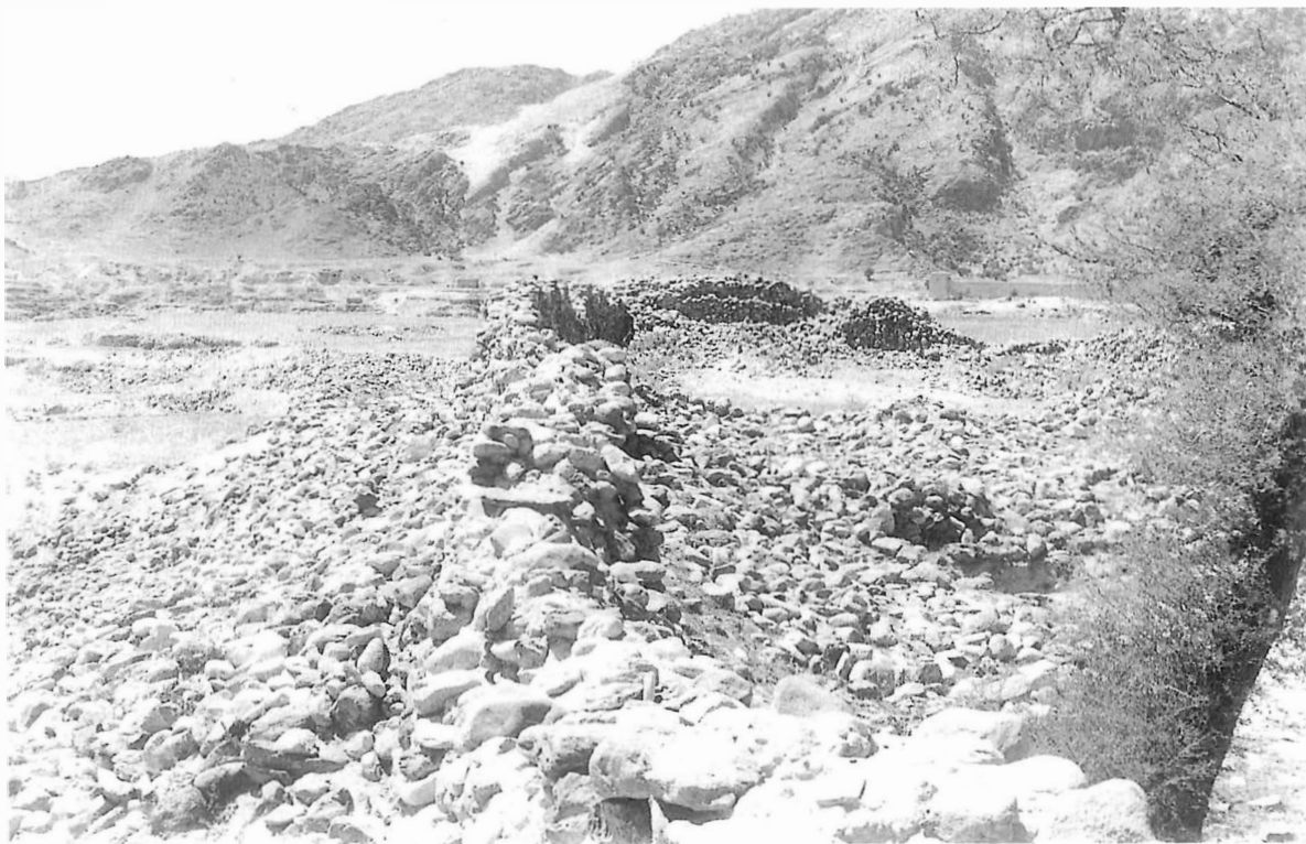
Pl. 4: Kanro Qala: Fallen stones and part of the enclosure wall.