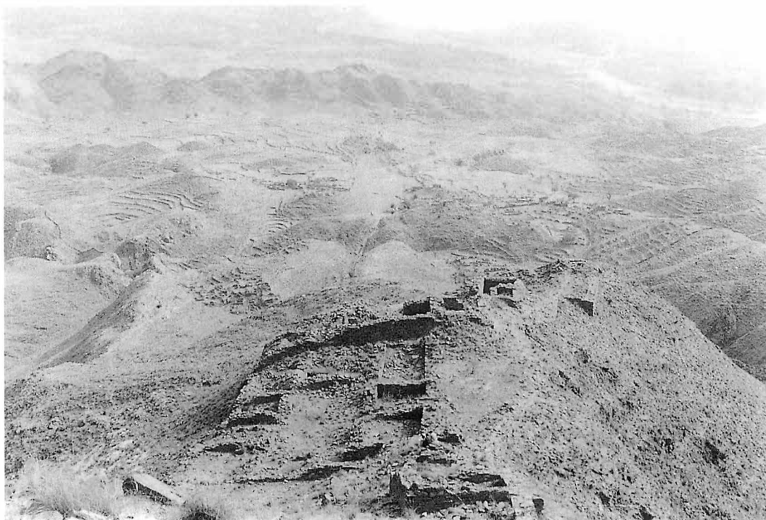
Pl. 10: Sapparai: A bird's eye view of the structural remains.