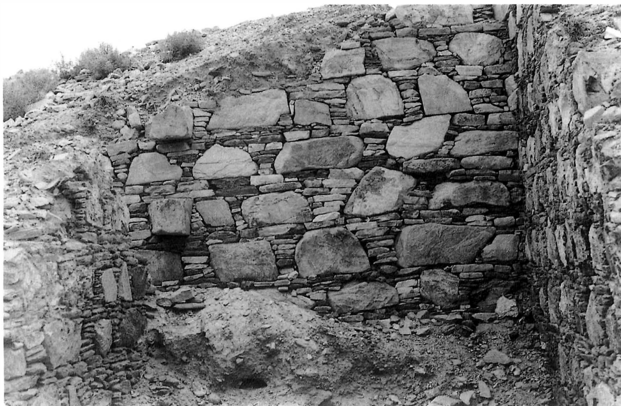
Pl. 7: Kotkai dherai: Inside walls of a room.