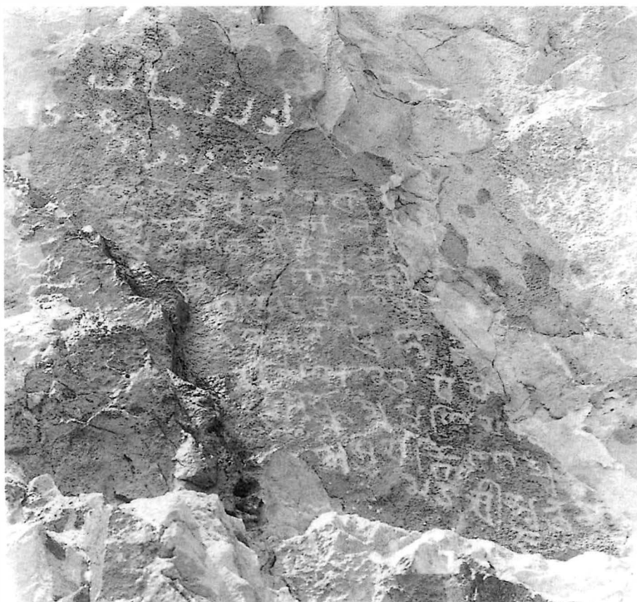
Pl. 8: Lakaro: Sharada rock inscription, its right side damaged.