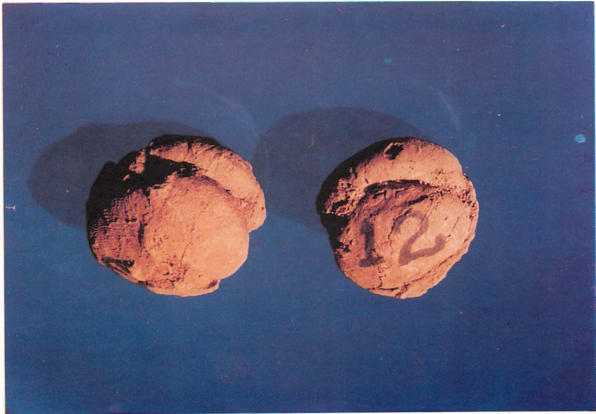
Fig. 19. Hund. Back side of the tablets (Group A)