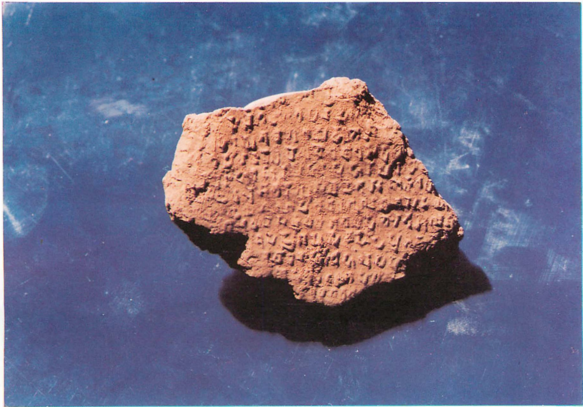
Fig. 18. Hund. Inscribed clay tablet (Group B)