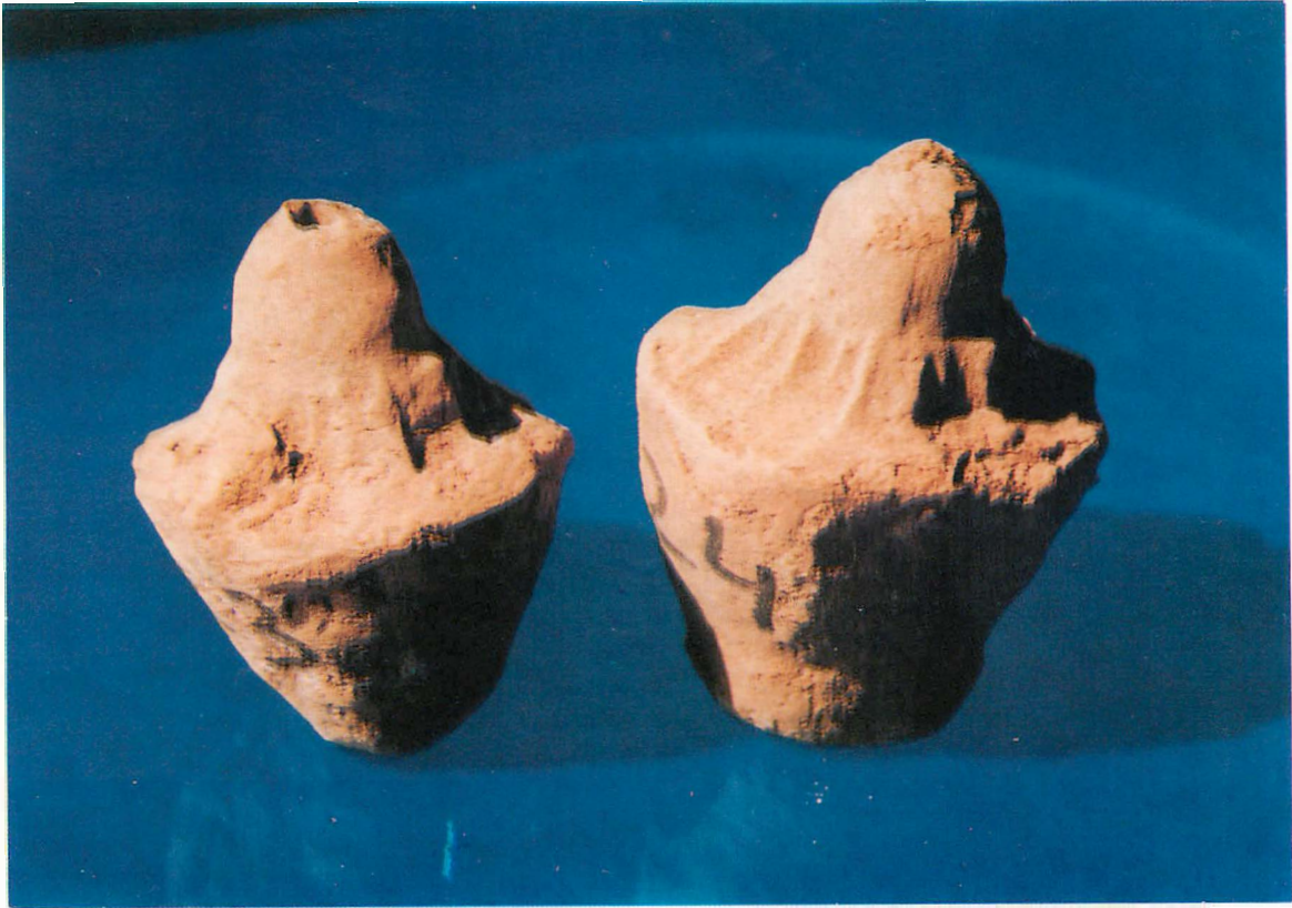
Fig. 3. Hund. Miniature stūpas, (Type II)