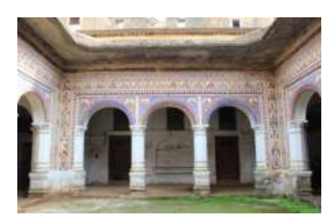
Plate 1. Courtyard with Murals