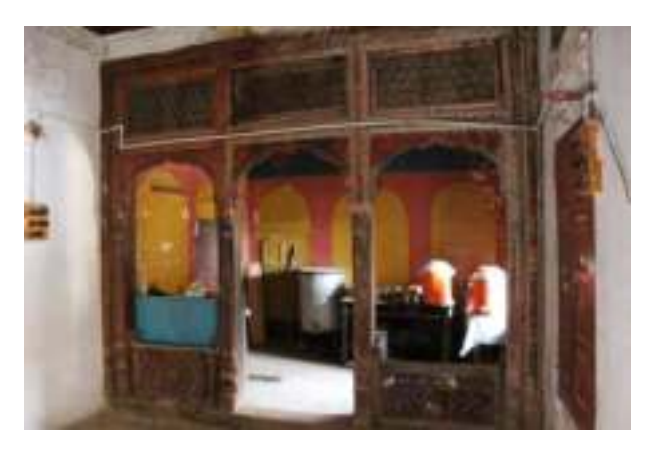
Plate 18: Room with wooden partition