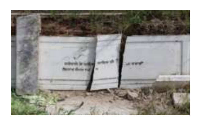
Plate 6: Grave of Hotay Shah