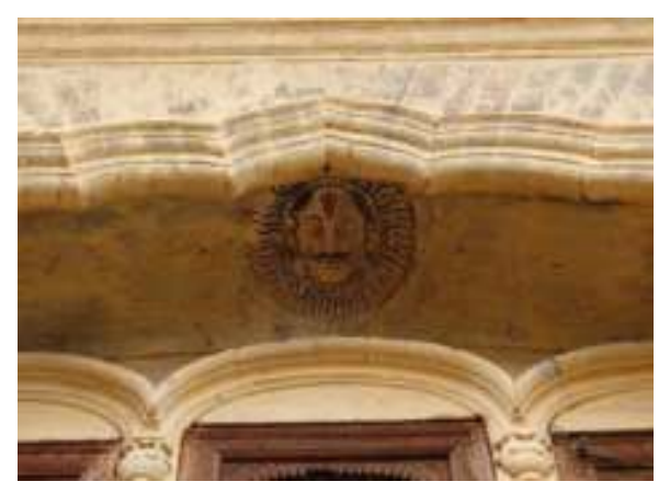
Plate 13: Arch with portrait