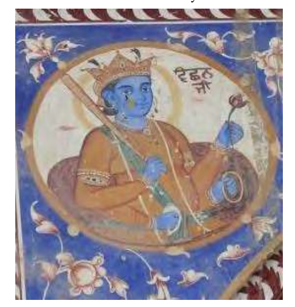
Plate 16: Fresco painting