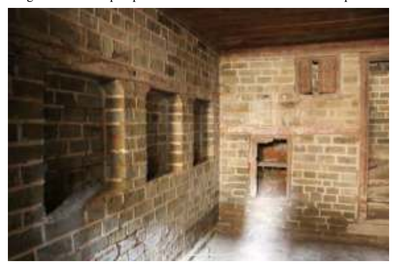
Plate 23: View of the basement