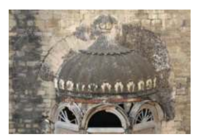
Plate 11: Detail of the Jharoka