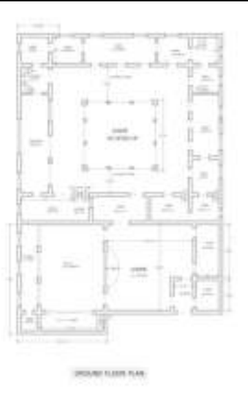
Plate 8: Ground floor plan