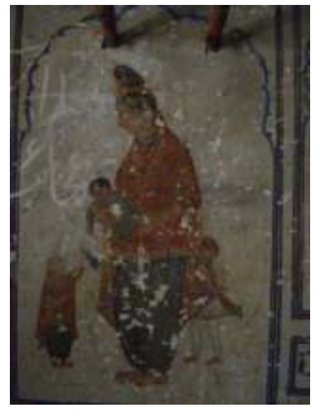
Plate 19: Fresco showing a woman with children