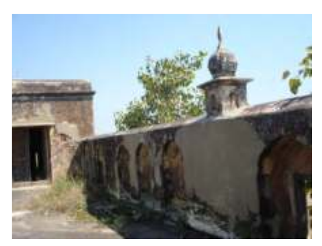
Plate 21: Viwe of the guardroom and parapet wall