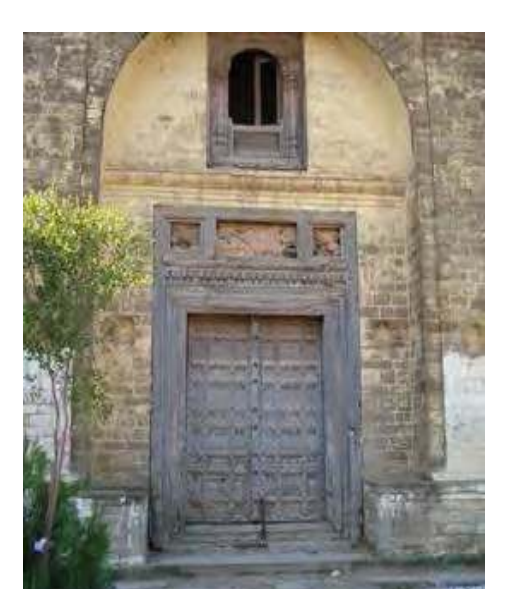
Plate 9: Fisrt entrance's door