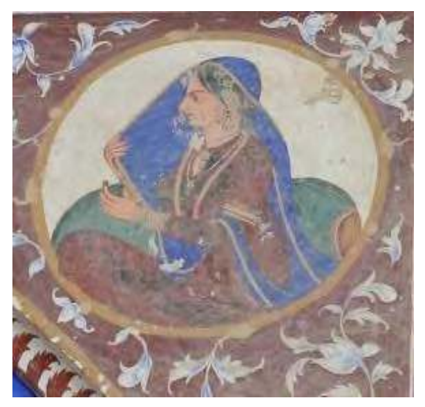
Plate 15: Fresco painting