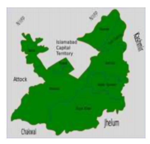
Plate 2: Location map of Kallar Syedan