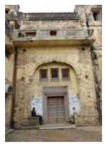
Plate 12: Second entrance gate