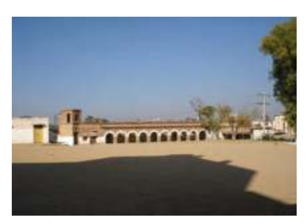
Plate 4. Court rooms