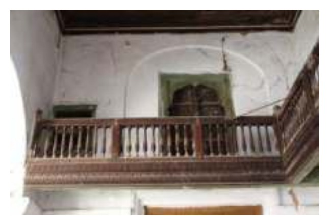
Plate 14: Balcony