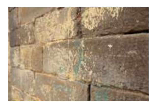
Plate 7: Stone wall