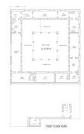
Plate 17: Plan of first floor