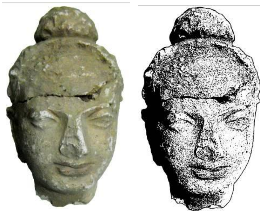
Figure 6. Male Head Probably Buddha Image