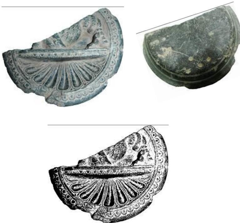
Figure 2. Toilet Tray with Sea-Monster