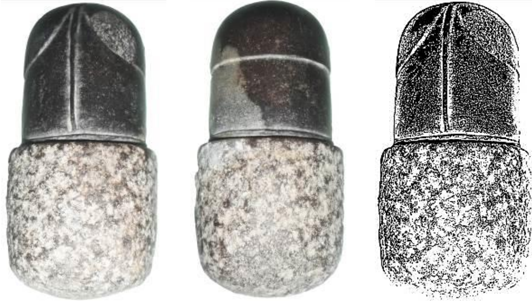
Figure 5. Linga with Prominent Feature in Stone