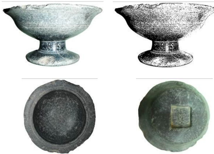
Figure 1. Fire Bowl of Green Phylite