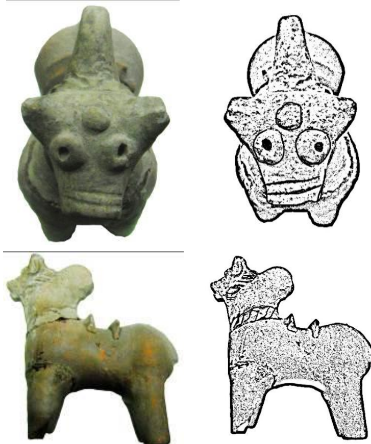
Figure 9. Bull Figurine with Pronounced Hump & Saddle at Back