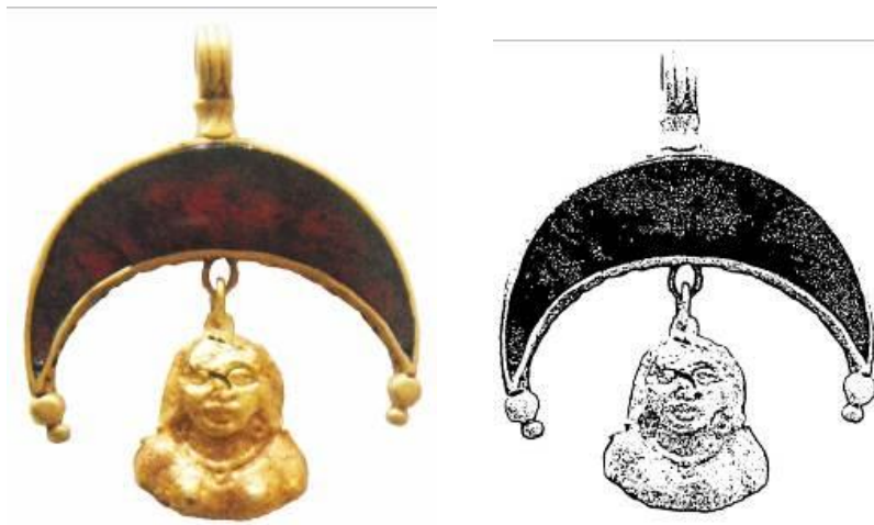
Figure 8. A Pendant with Lady Image in Repousse