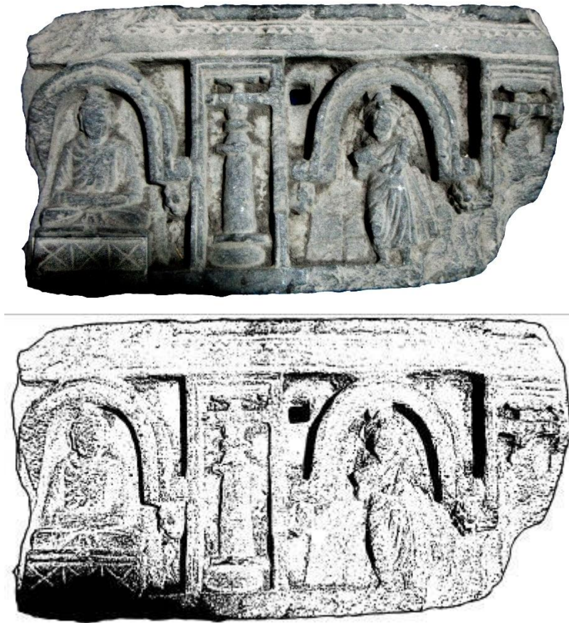
Figure 3. Relief Penial with Buddha in Meditation Pose