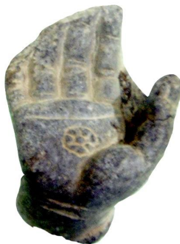
Figure 4. Hand with Chakra Impression Raised in Abhayamudra