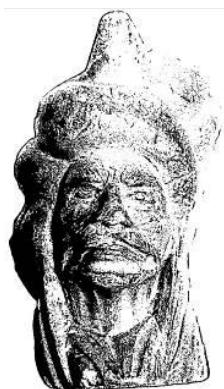
Figure 10. Ivory Ferulle, Moustached Image