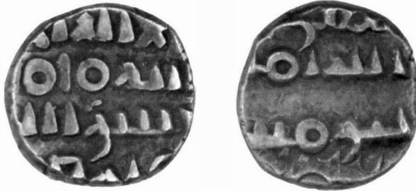
Fig. 4. Silver coin in the name of the Caliph al-Mu'izz from Multan (1980,0717.2)