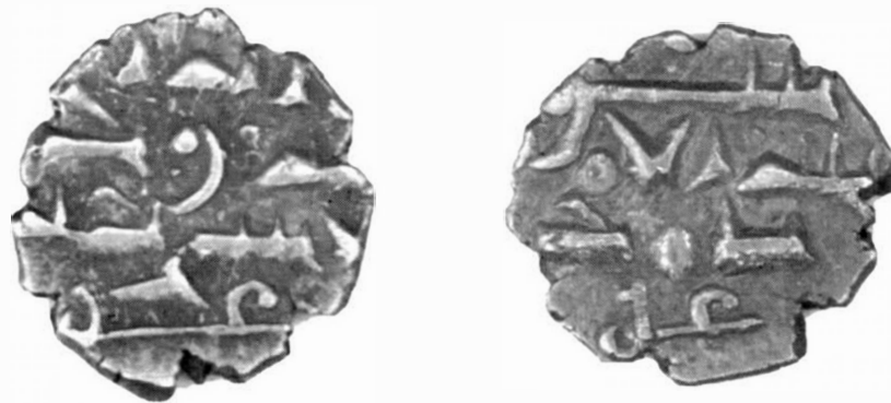
Fig. 6. Coin of Ahmad with additional inscription (1997,0705.97)