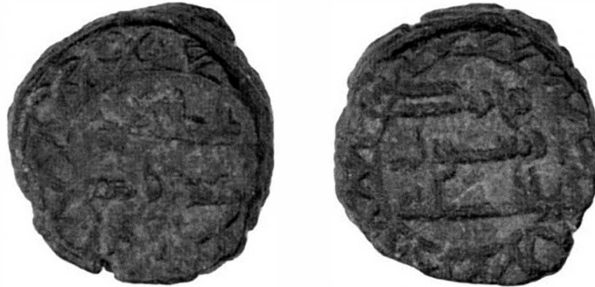
Fig. 1. A Copper Coin of the Governor 'Umar Ibn Hafis (OR.1654)