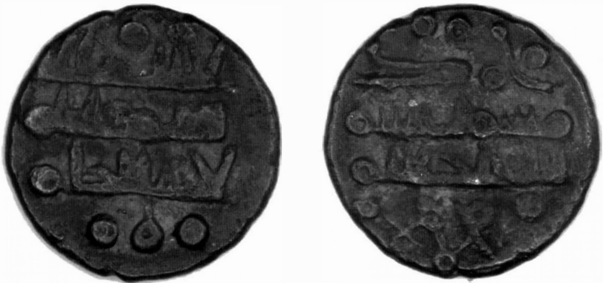
Fig. 5. Qanhari Dirham of Mahmud (IOC.1413)