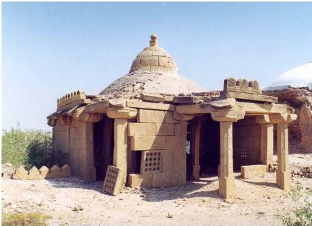
Pl. 1 - Madrasah of Shaikh Isa Langoti: General view