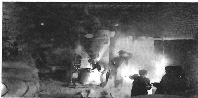
Fig. 2. Occupational exposure to airborne asbestos during milling and packing of asbestos in Nawa Killi, Mohmand Agency.